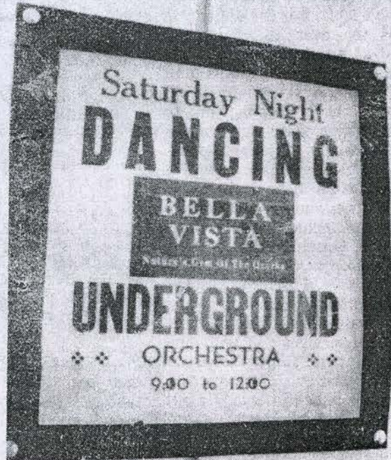
1930s Wonderland Cave poster